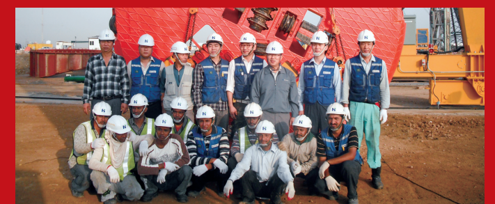
Iseki Instructor could help not only site assembly, but also Project planning to smooth implementation.