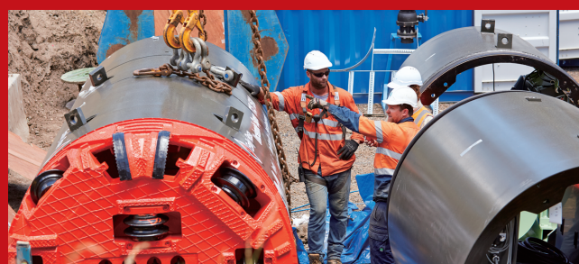
Project location : Melbourne (Australia) Soil condition : Basalt