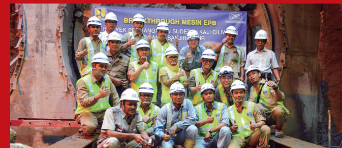
Iseki with 2 other company consortium assisted the longest drive (570m) with 3.5m EPB machine in Jakarta!