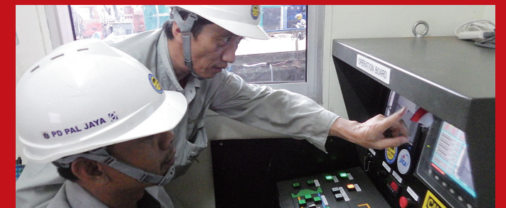
Jacking instructor supervise and train your staff.