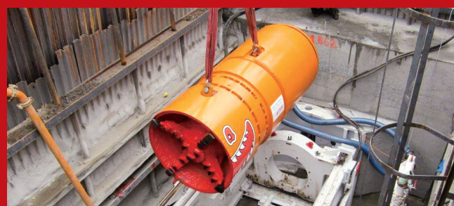
Project location : Bahrain, Middle East Soil Condition : Granular sand