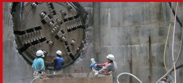
The biggest machine \phi 3.5 diameter break through hard rock condition!