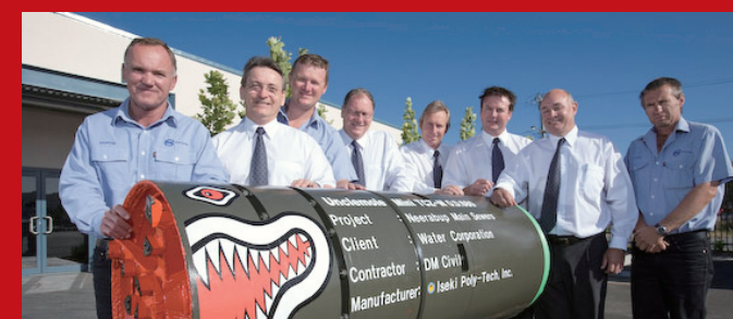
Unclemole series are the most welcomed machine through the world.